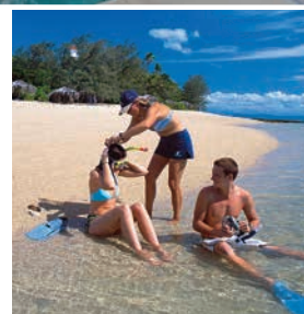
PERFECT FOR ALL AGES